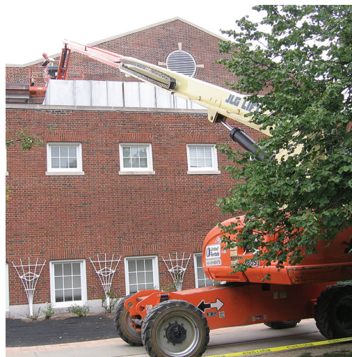
Theatre Arts Building